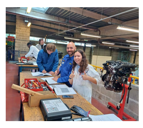
Teach course modules or lead practical work sessions

Contributing to the training of IFP School's students also involves providing them with tangible knowledge via courses, workshops and site visits: an alternative way for our partners to promote their expertise and know-how, and further raise their profile. In addition, through its Steering Committees, partner companies are provided with the opportunity to play an active role in the evolving design of the School's various programs and the profiling of future student intakes.